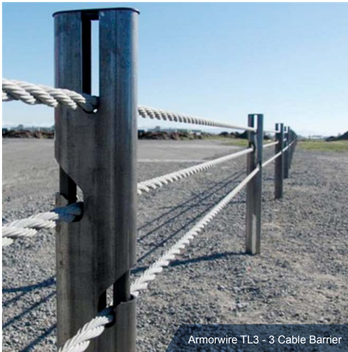
Armorwire TL3 - 3 Cable Barrier

The Armorwire Test Level 3 – 3 Cable Barrier and Test Level 4 – 4 Cable Barrier have been tested to the guidelines in NCHRP 350 for longitudinal cable barriers. When installed correctly the system will allow an errant vehicle to be stopped, contained or redirected in a safe manner.