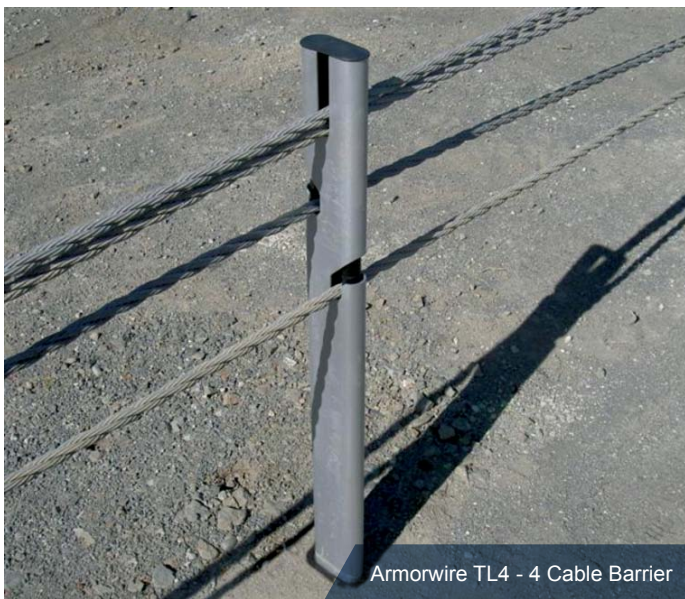
Armorwire TL4 - 4 Cable Barrier